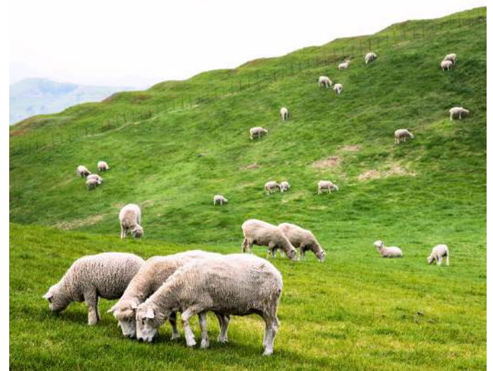
📍 Daegwallyeong Sheep Farm

We hope you enjoyed your trip to Korea with Nam Ho Travel!