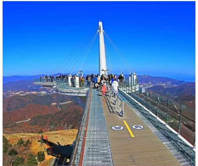
📍 Balwangsans Sky Walk

Accommodation: Seoul Yongsan Novotel Ambassador Hotel or similar