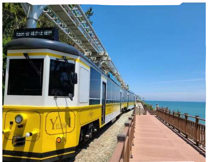
📍 Heundae Beach Train

Accommodation: Jeonju Ramada Hotel or similar