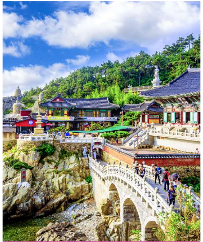
📍 Haedong Yonggungsa Temple

Tour leader (if any) SGD $40 per person including children.