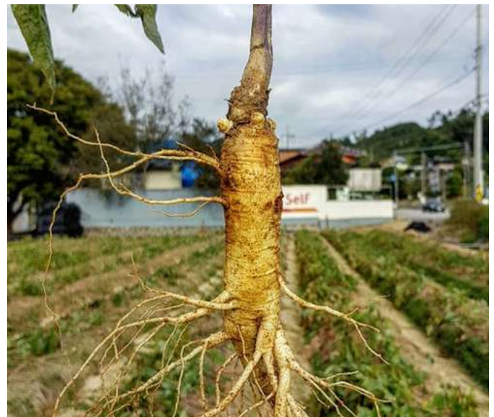
📍 The Painters show

Accommodation: Seoul Yongsan Novotel Ambassador Hotel or similar