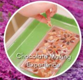
Chocolate Making Experience