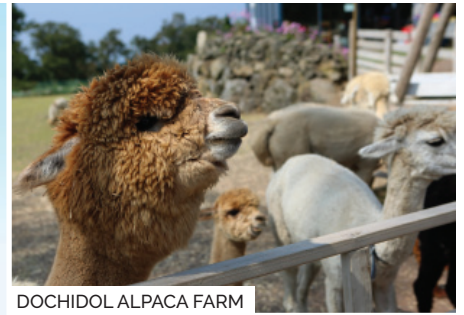
DOCHIDOL ALPACA FARM