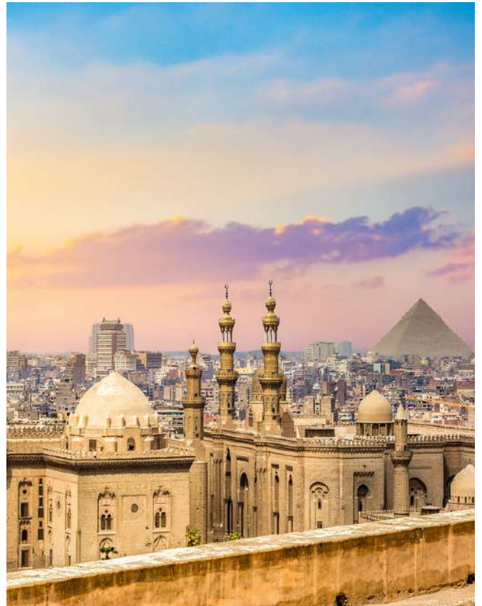
📍 Old Cairo