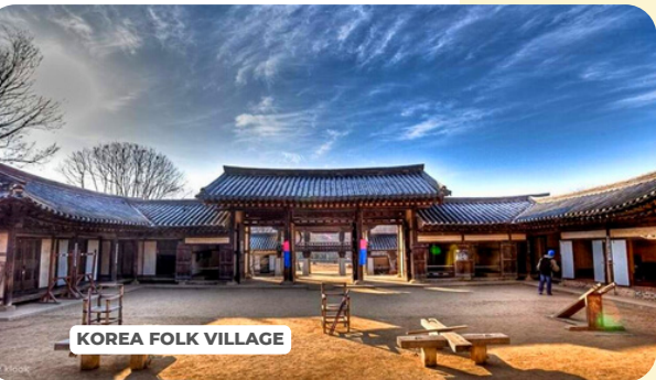
KOREA FOLK VILLAGE