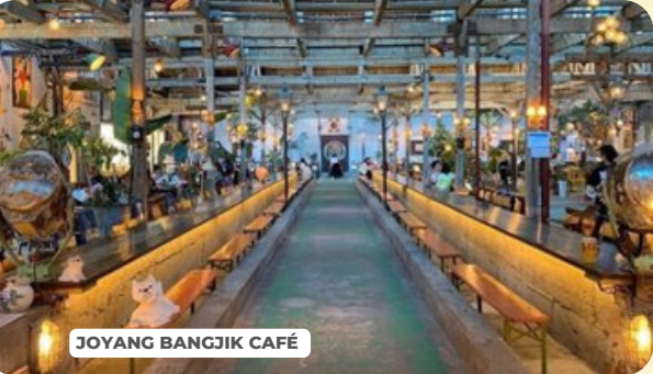
JOYANG BANGJIK CAFÉ