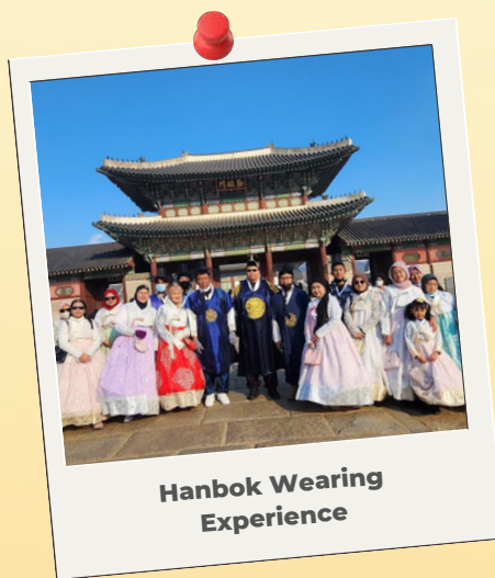
Hanbok Wearing Experience