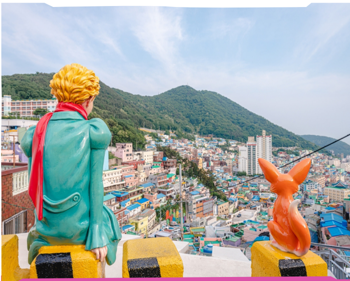
📍 Gamcheon Culture Village