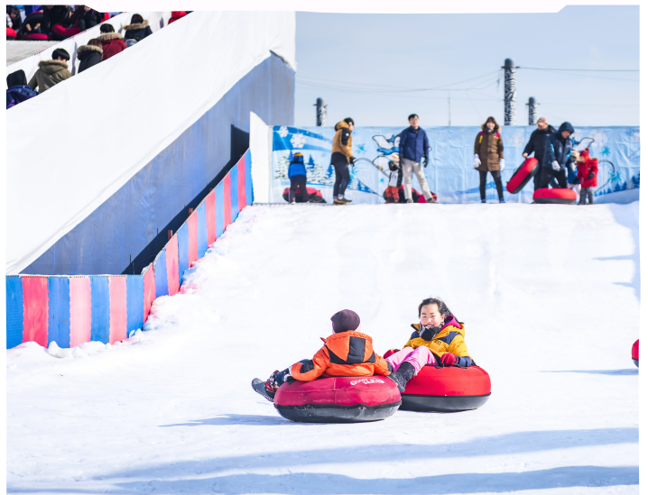
Snow ski activities