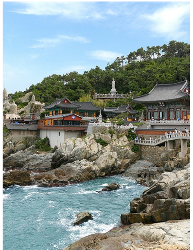
📍 Haedong Yonggungsa Temple