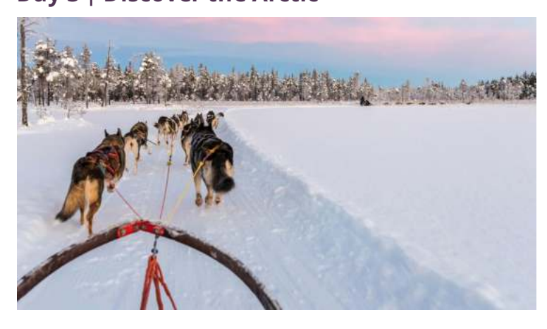
Day 3 | Discover the Arctic

Today is your chance to try your hand at some winter activities. Perhaps ride a snowmobile, try snow shoeing, or build yourself a snowman. This evening, you'll want to join an Optional Experience to go out 'hunting' for the Northern Lights with an expert Local Specialist, who will explain this extraordinary phenomenon and maximise your chance of a sighting.