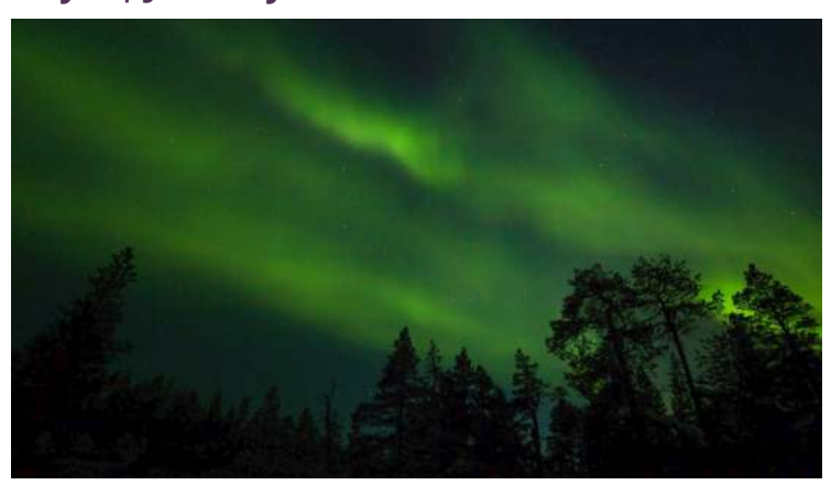
Day 2 | Journey to Saariselkä

Today our flight takes us north from Helsinki, across the Arctic Circle to Ivalo. On arrival, we delve into the centuries-old traditions and heritage of the Sámi people on our MAKE TRAVEL MATTER® Experience at the Siida Sámi Museum on the shores of Lake Inari. Explore the museum's collections showcasing the spirit and history of Sámi culture over the centuries, as well as the evolution of the Sámi languages, Northern Lapland's unique natural environment and how this community has survived and indeed thrived in the Arctic's extremes. Later, a short drive brings us to the enchanting snowy escape of Saariselkä, our home for the next two nights.