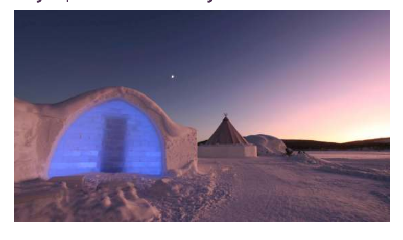
Day 7 | Kiruna Your Way

Today you have a free day to get acquainted with this Swedish mining centre, which is in the process of being relocated a few miles from its original location due to the growing size of the iron mine beneath its surface. Perhaps join a unique Optional Experience, navigating the snowy landscape on a husky safari, holding on tight as the eager dogs race across the white landscape. This exhilarating encounter with one of the most special canine breeds in the world is an experience you'll never forget. In the afternoon, you might choose to visit the incredible Icehotel on an Optional Experience to marvel at the ice sculptures and have a drink at the Ice Bar. Tonight, be sure to take the last chance to catch a glimpse of the Northern Lights in this extraordinary Arctic environment.