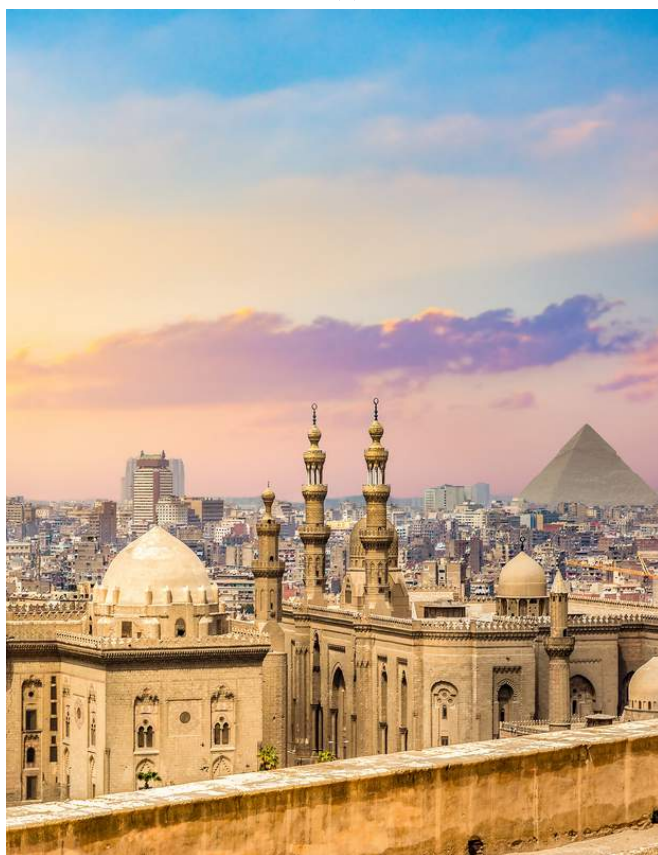
📍 Old Cairo