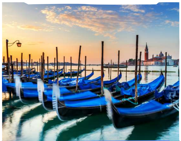
📍 Gondolas of Venice