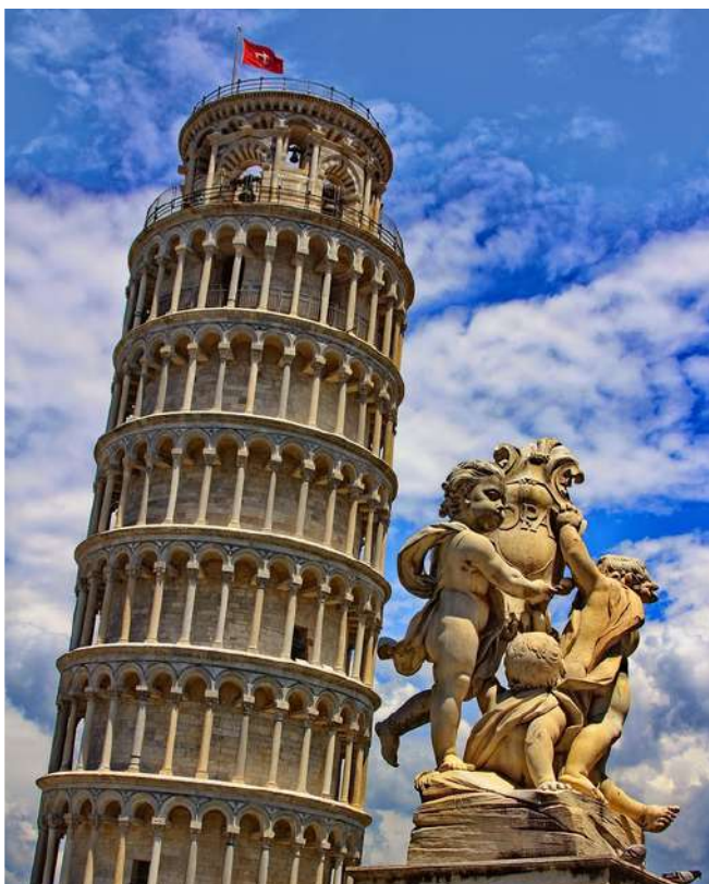
The Icon Of Pisa - The Bell Tower