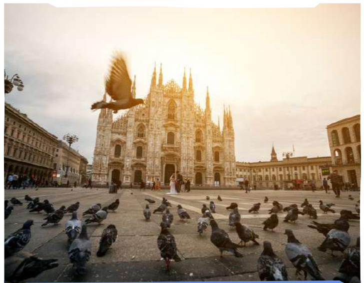
📍 Piazza del Duomo