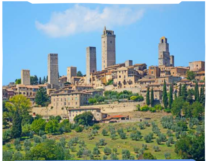
📍 San Gimignano