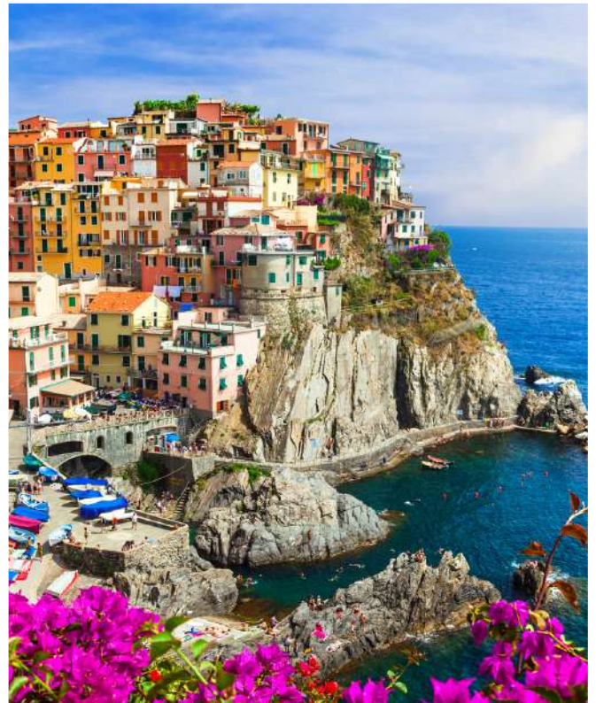
Beautiful Cinque Terre

Day 1 | SINGAPORE - MILAN Meals on Board