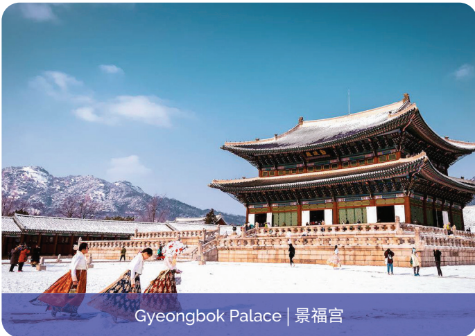
Gyeongbok Palace | 景福宫