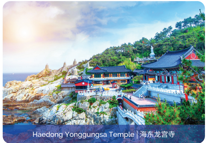
Haedong Yonggungsa Temple | 海东龙宫寺