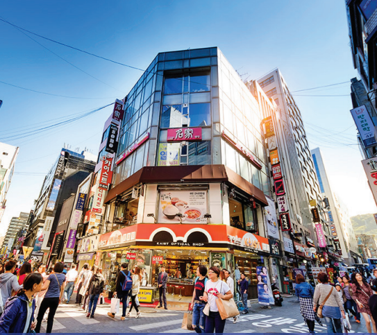
Myeongdong | 明洞