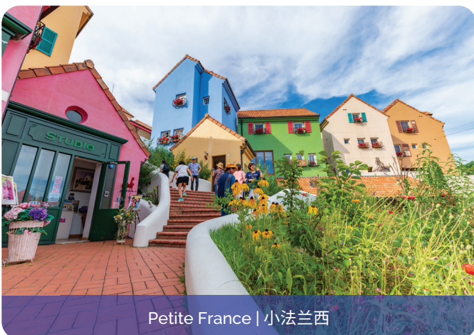
Petite France | 小法兰西