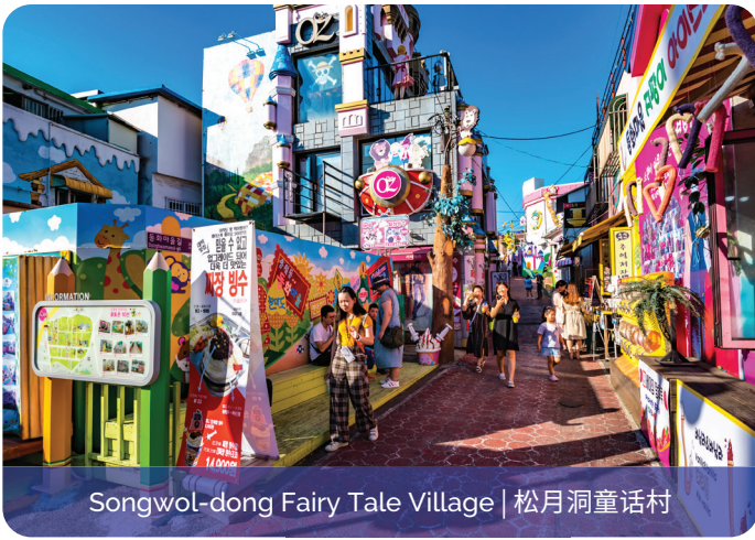
Songwol-dong Fairy Tale Village | 松月洞童话村