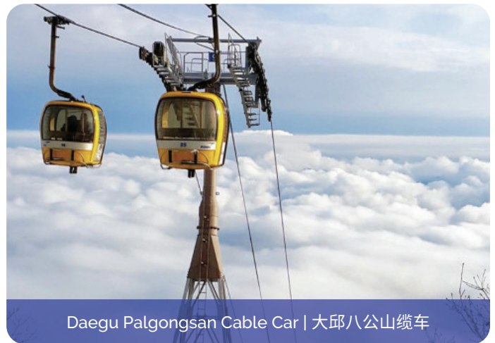
Daegu Palgongsan Cable Car | 大邱八公山缆车