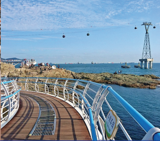
Songdo Skywalk | 松岛天空步道