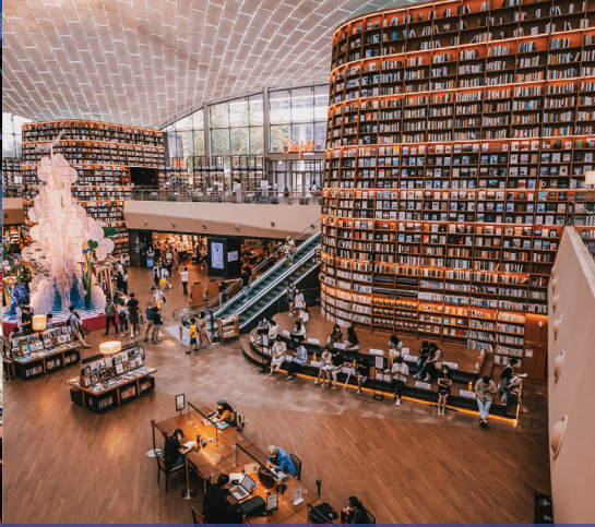
Coex Starfield Library | 星空图书馆