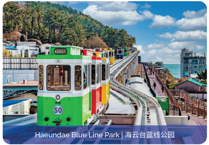
Haeundae Blue Line Park | 海云台蓝线公园