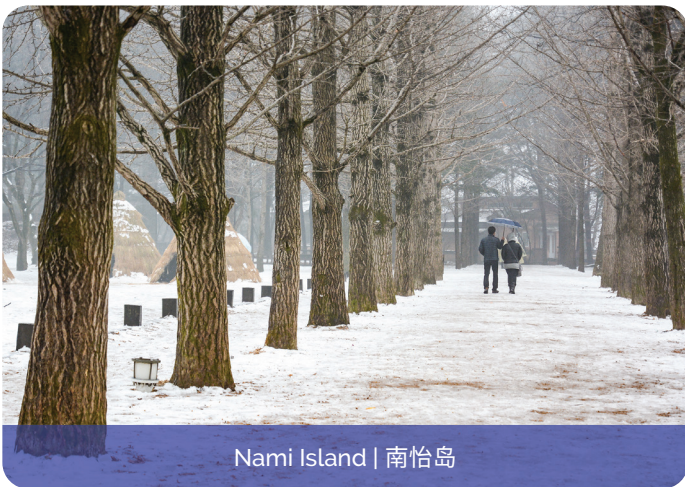
Nami Island | 南怡岛