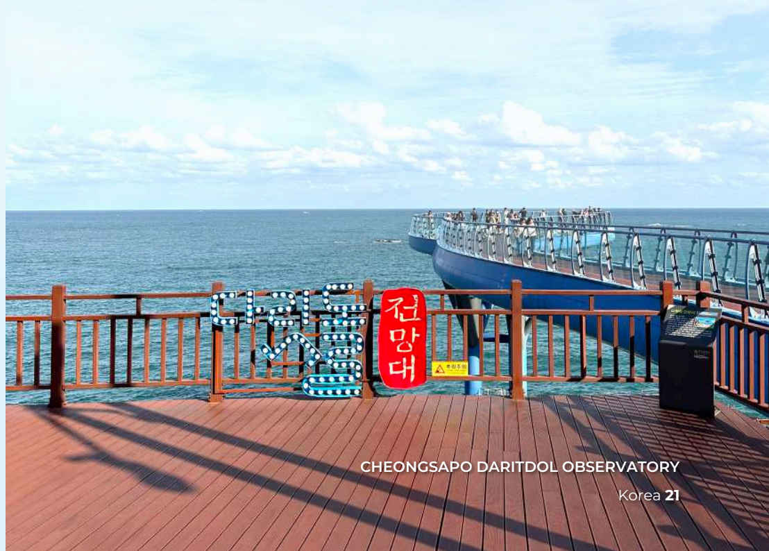
CHEONGSAPO DARITDOL OBSERVATORY

*Note: Hotels subject to final confirmation. Should there be changes, customers will be offered similar accommodations as stated in this list.