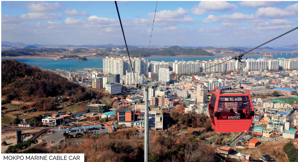
MOKPO MARINE CABLE CAR