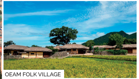
OEAM FOLK VILLAGE

making salt. Everyone can obtain a 500-gram bag of salt and taste salt ice cream . Thereafter, enjoy salt therapy at the Salt Cave Healing Center and visit Salt Museum to learn more about the manufacturing process of salt, arguably one of the most under-appreciated ingredients in everyday life.