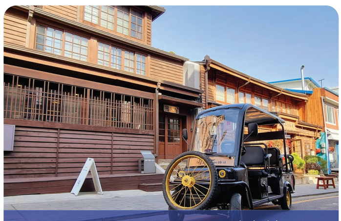
Eco Friendly Electic Car Ride | 环保电动车