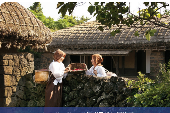
Jeju Folk Village | 济州民俗村博物馆