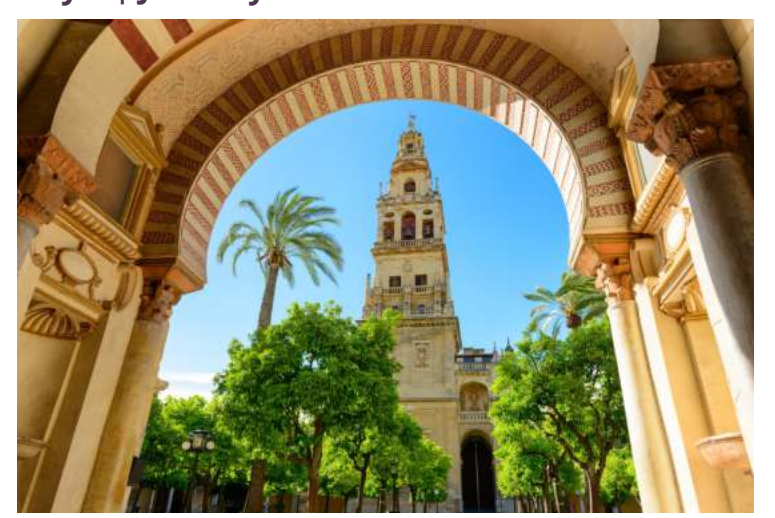
Day 3 | Journey to Córdoba and on to Seville

Journeying south through La Mancha, we arrive in Córdoba, once a significant Moorish capital. Join a Local Specialist to visit the Mosque of the Caliphs and learn about centuries of Moorish rule and its influence on the culture and architecture of the region. We travel to flamboyant Seville, our home for the next two nights.