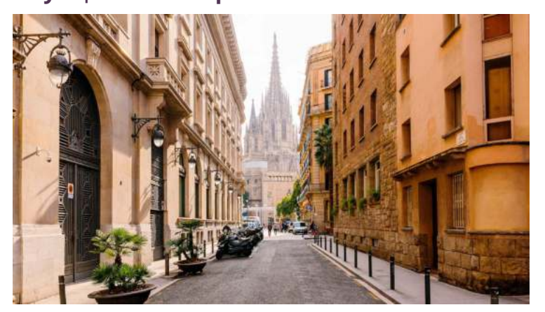
Day 9 | Farewell Spain

Bid a fond adiós to Spain at the end of a memorable holiday. Find out more about your free airport transfer at trafalgar.com/freetransfers.