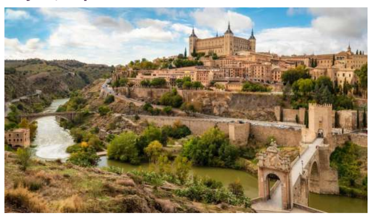
Day 2 | Explore Vibrant Toledo

We head to Toledo, the former capital of Spain, where we join a Local Specialist for a walking tour of this city that dates back to Roman times. We'll visit a traditional factory and Dive Into Culture, witnessing the age-old inlaid-steel craft, before seeing one of El Greco's most famous paintings in the Church of Santo Tomé - 'The Burial of the Count of Orgaz'. We'll also visit the synagogue, before returning to Madrid where we'll admire the Royal Palace and Cibeles Fountain with our Local Specialist. Spend the evening on your own, or delve into the sights and flavours of Spain's capital with an Optional Experience.