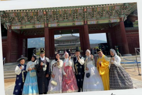
Hanbok-Wearing at Gyeongbok Palace