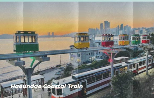
Haeundae Coastal Train