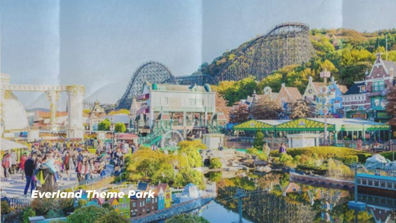
Everland Theme Park