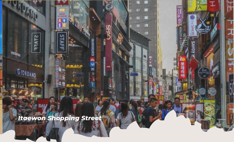
Itaewon Shopping Street