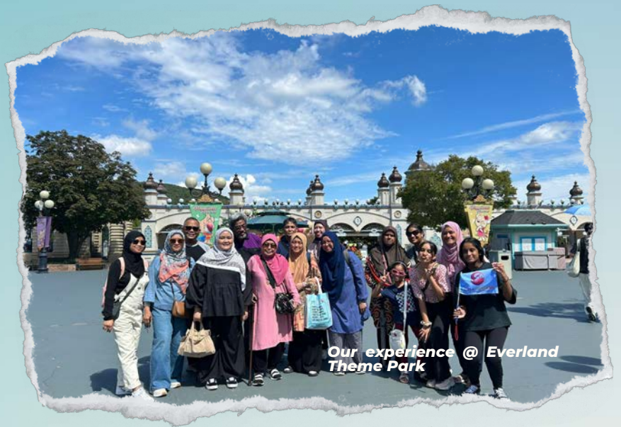
Our experience @ Everland Theme Park