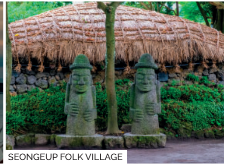
SEONGEUP FOLK VILLAGE