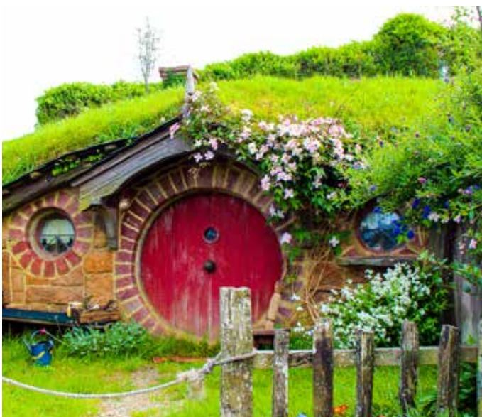
Hobbiton Movie Set