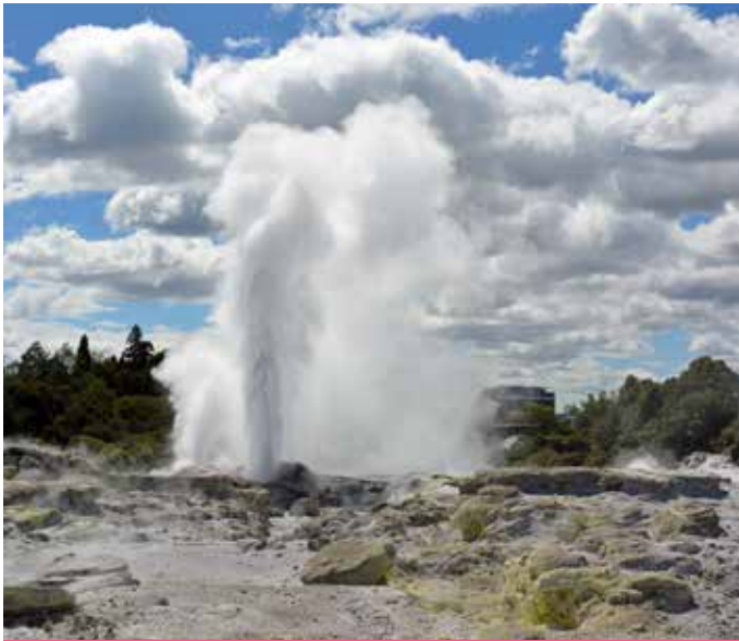
Te Whakarewarewa geyser terrace