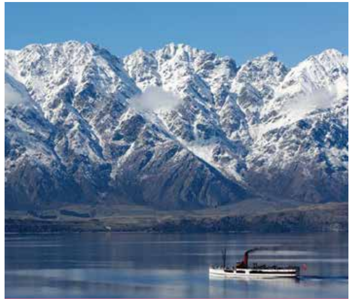
TSS Earnslaw Vintage Steamship

Note : During the annual maintenance period from 25 May to 10 July, TSS Earnslaw transfers to/ from Walter Peak Farm will be replaced by launch.