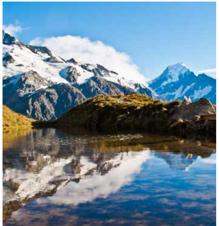
Mount Cook National Park

Note : Depending on circumstances, overnight accommodation may be outside of Lake Tekapo region.