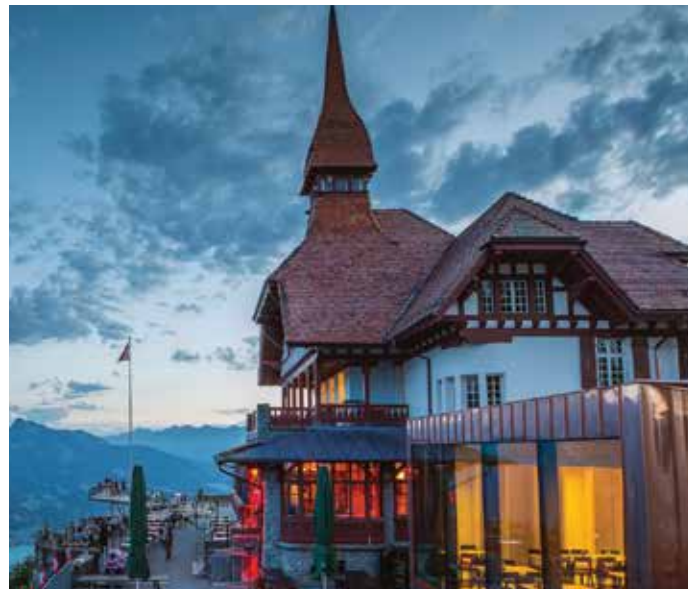
Harder Kulm Panorama Restaurant