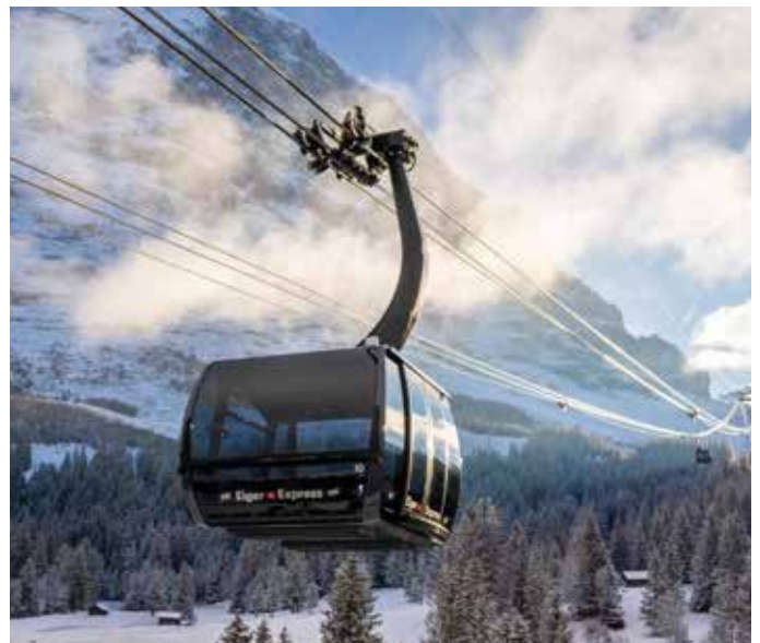
Eiger Express Tri Cable Gondola