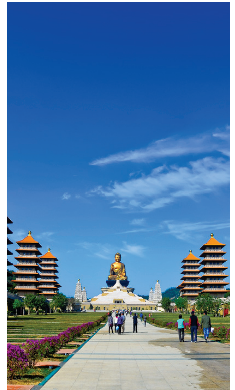
Fo Guang Shan Buddha Museum

- Breakfast / Lunch: Taiwan Cuisine - After breakfast, visit the Natural Way Six Arts Cultural Center , an urban cultural oasis whose buildings date back to the Japanese colonial era. In