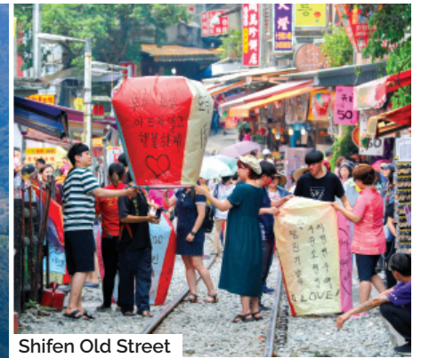
Shifen Old Street