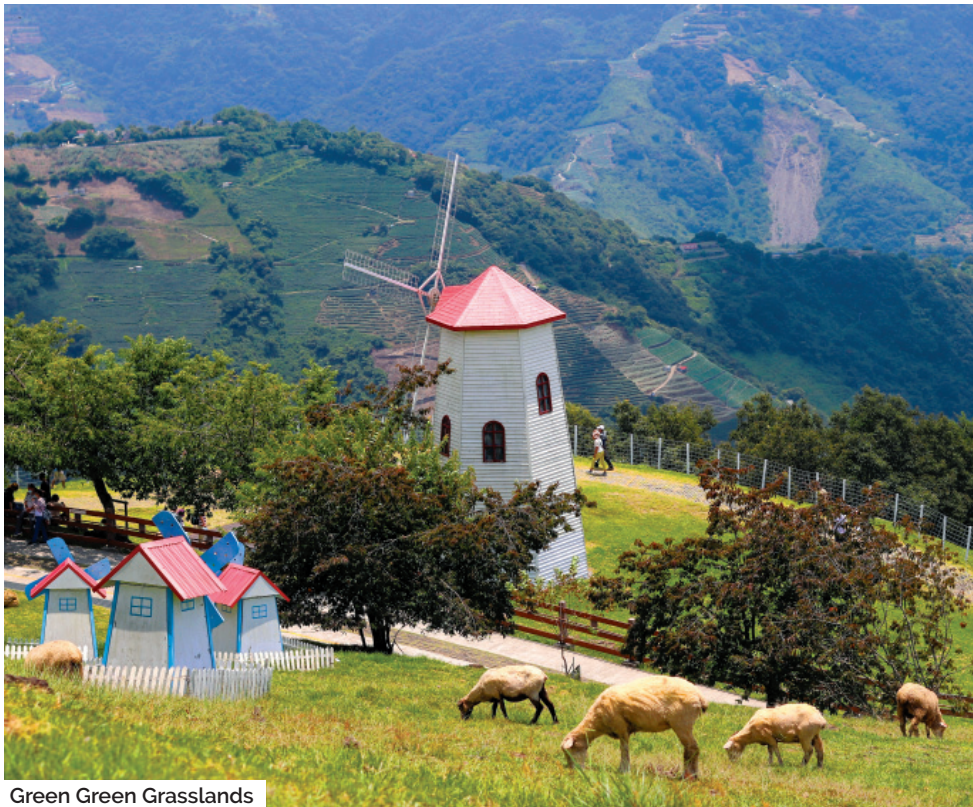
Green Green Grasslands