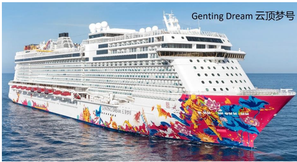
Genting Dream 云顶梦号