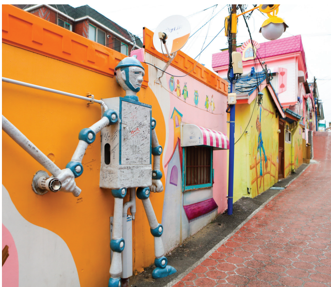
Songwol-dong Fairy Tale Village