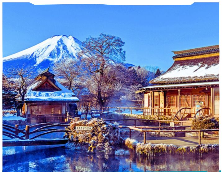
📍 Oshino Hakkai

Accommodation: Hida Plaza Hotel or similar ( Onsen Hot Spring )