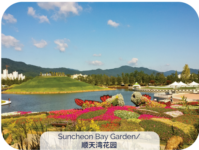
Suncheon Bay Garden/ 顺天湾花园