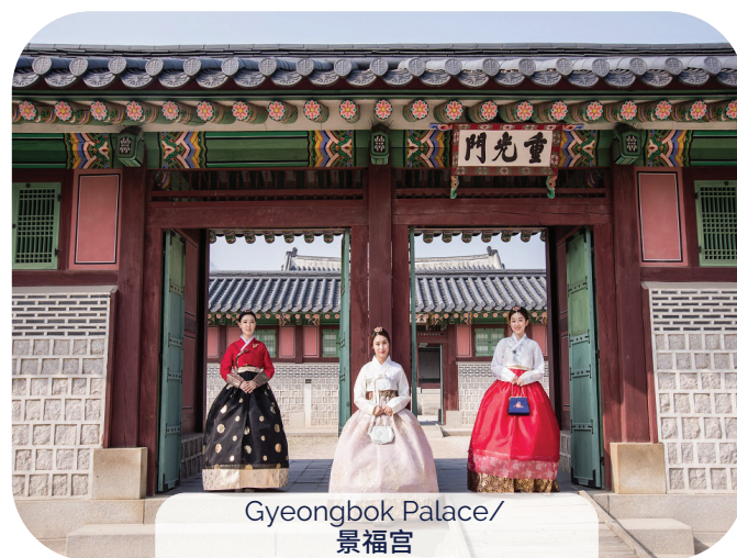
Gyeongbok Palace/ 景福宫

*Note : A levy of USD150 will be collected from each passenger who leaves the Seoul City tour group.