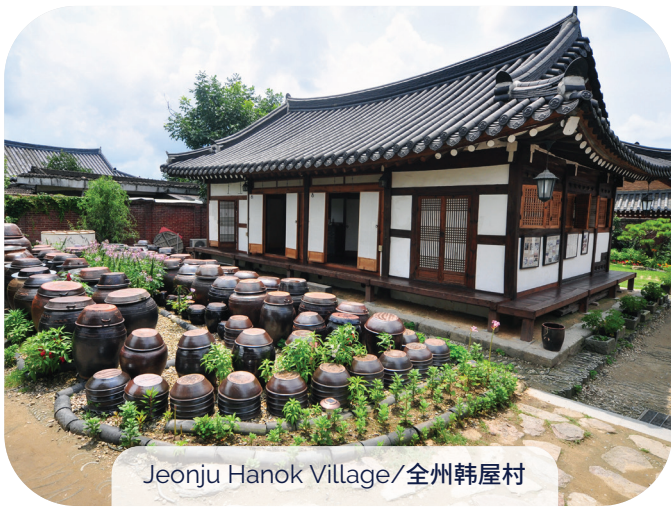
Jeonju Hanok Village/全州韩屋村