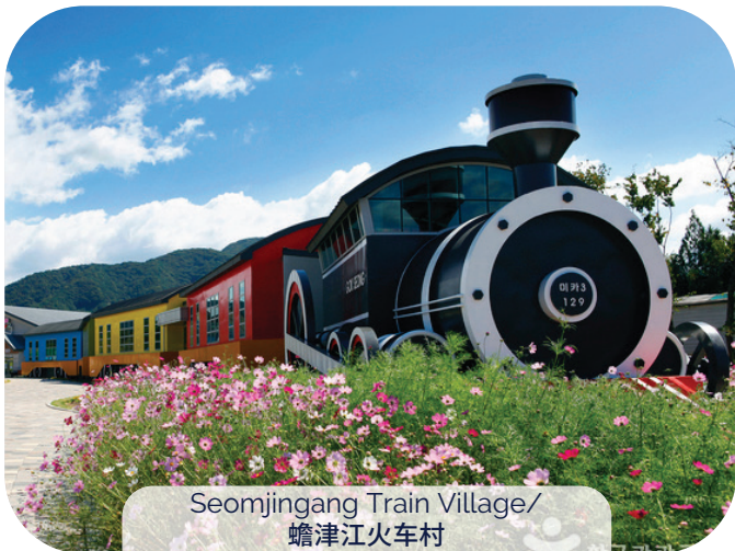
Seomjingang Train Village/ 蟾津江火车站