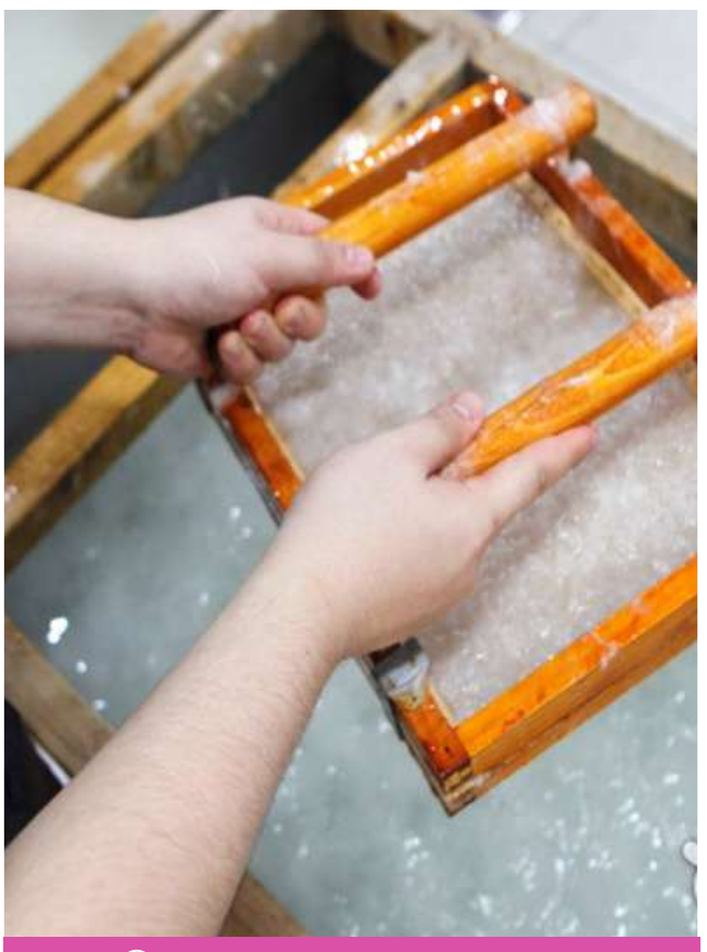
Wonju Hanji Theme Park