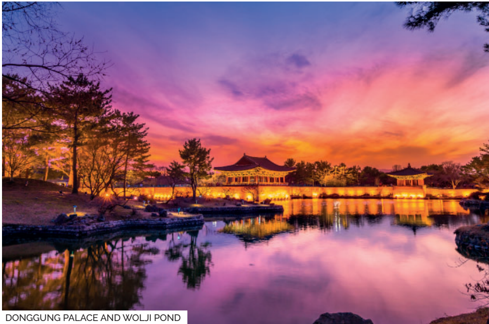
DONGGUNG PALACE AND WOLJI POND