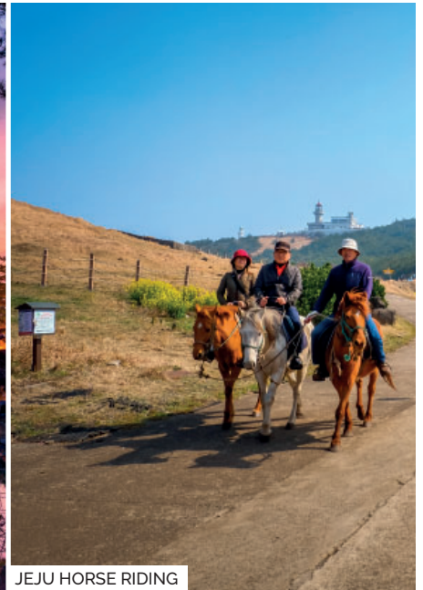
JEJU HORSE RIDING

shopping products, allowing you to shop to the fullest and enjoy the pleasure and fun of shopping.