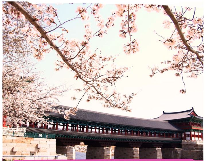
📍 Woljeongyo Bridge