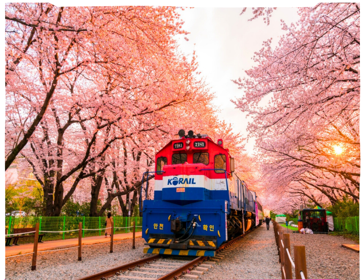
Kyunghwa Train Station