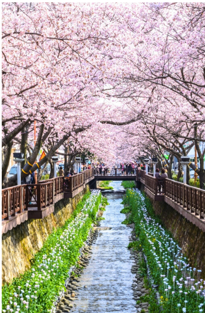
📍 Yeojwa Stream & Yeojwa Bridge

Accommodation: Jeju ASTAR Hotel or similar