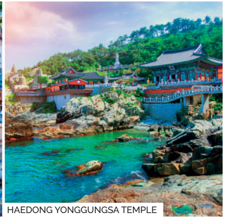
HAEDONG YONGGUNGSA TEMPLE

Yonggungsa Temple. A rare temple that is located by the sea near the beautiful coastal area with amazing view. Then head to the Ulsan and explore Ganjeolgot Junk (ECO) Art Park. This is the first place in Korea to welcome the sunrise. In the distance are the rolling mountains; in front of you is the turbulent sea, as well as the huge wishing mailbox and windmill. It is a not-to-be-missed photo-taking spot! Thereafter, visit Whale Cultural Village to see the good old days of whaling through sculptures and murals.