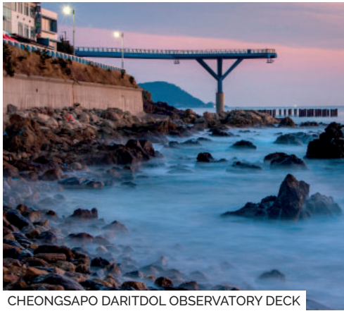
CHEONGSAPO DARITDOL OBSERVATORY DECK