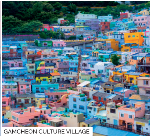
GAMCHEON CULTURE VILLAGE