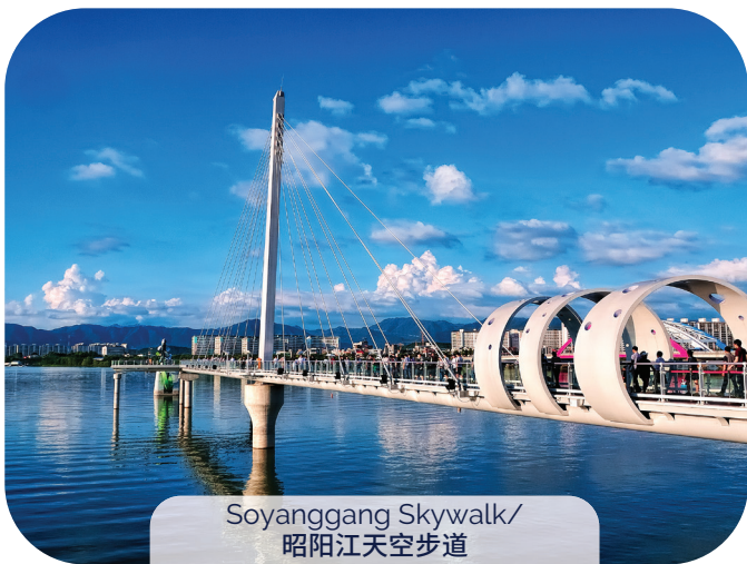
Soyanggang Skywalk/ 昭阳江天空步道