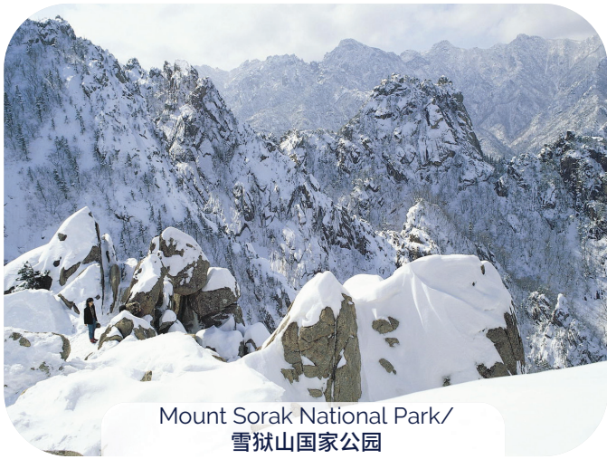
Mount Sorak National Park/ 雪嶽山国家公园