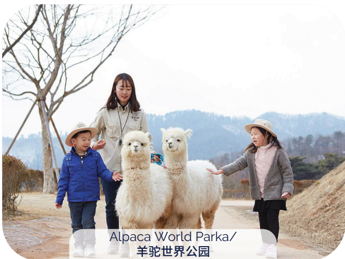
Alpaca World Park/ 羊驼世界公园