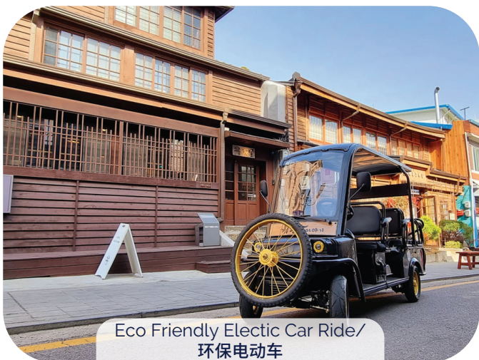
Eco Friendly Electric Car Ride/ 环保电动车