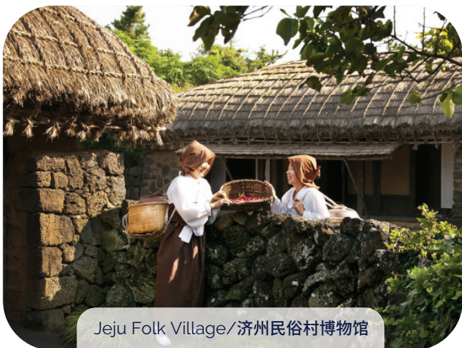
Jeju Folk Village/济州民俗村博物馆