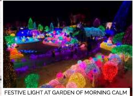
FESTIVE LIGHT AT GARDEN OF MORNING CALM

the alpacas up close. Thereafter to Deep Dive Museum . A place to experience augmented reality media art to the fullest. Next Take the Balwangsan Cable Car , the longest cable car in Korea, see the beautiful scenery of Pyeongchang, Gangwon-do, feel as if you are soaring in the sky of Balwangsan Mountain, and feel as if you are floating on the clouds at the Skywalk .