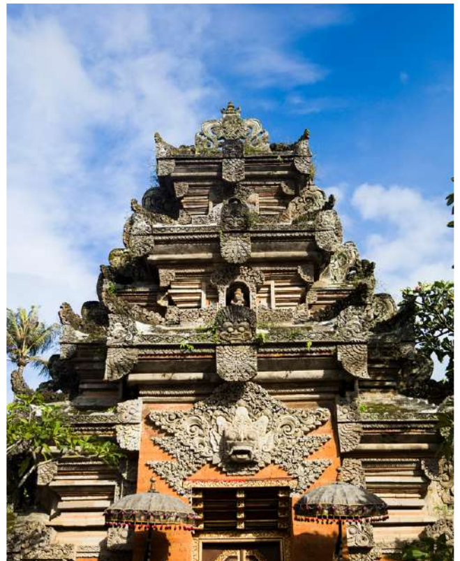
📍 Ubud Royal Palace