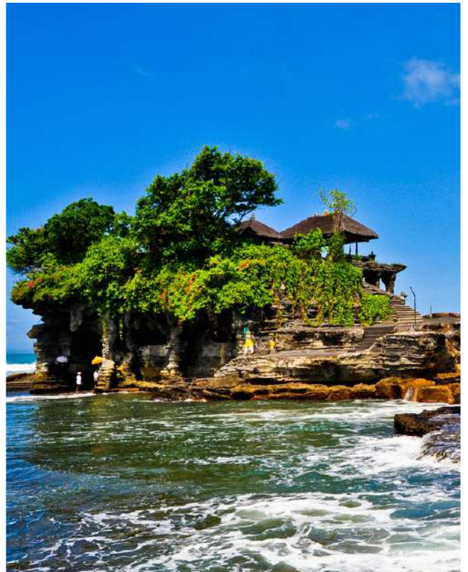
📍 Tanah Lot Temple