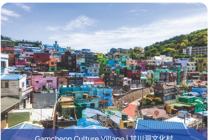
Gamcheon Culture Village 甘川洞文化村