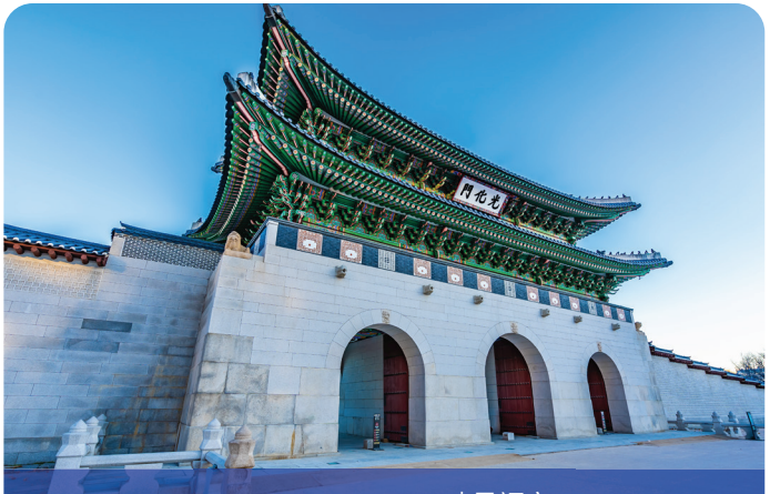
Gyeongbok Palace | 景福宫