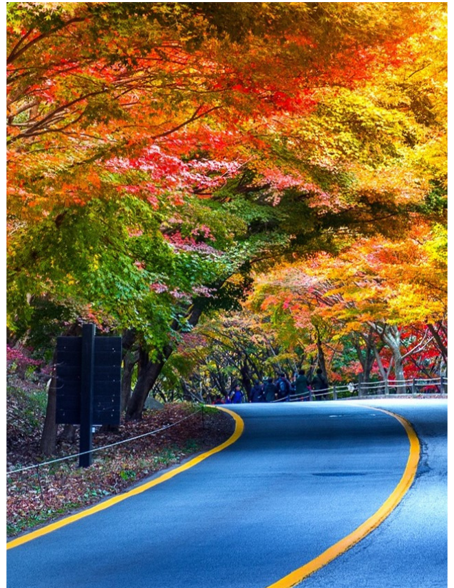
📍 Naejangsan National Park

Accommodation: Suwon Value Hotel or similar