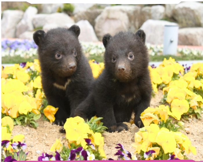
📍 Beartree Park