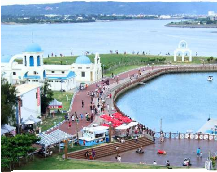
📍 Nanliao Fishing Port