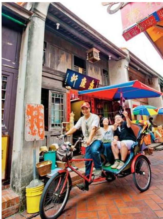
📍 Lukang Old Street (trishaw ride)

After breakfast, proceed to Taoyuan airport for our flight back to Singapore. We hope you enjoyed your trip to Taiwan with Nam Ho Travel!