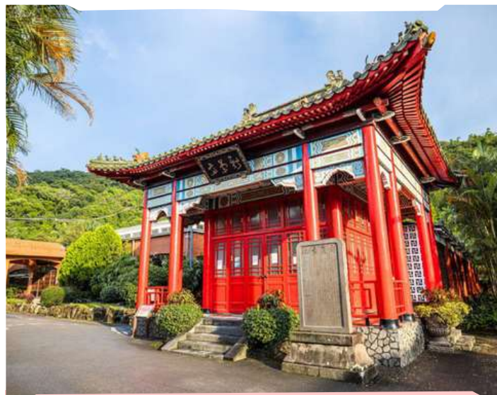
📍 Shilin Official Residence Garden

Accommodation: 5*Sheraton Grand Taipei Hotel or similar