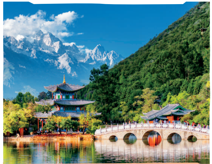
📍 Heilong Lake