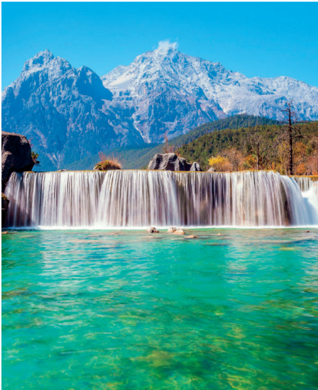
📍 Yushui Village