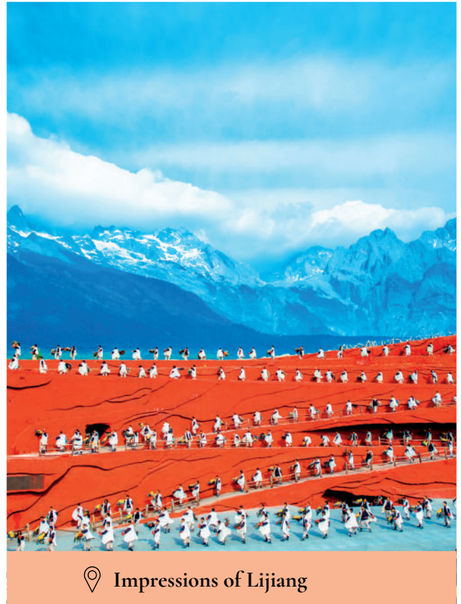
📍 Impressions of Lijiang