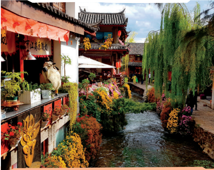
📍 Lijiang Ancient Town