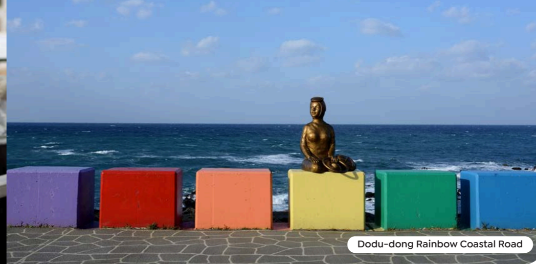
Dodu-dong Rainbow Coastal Road