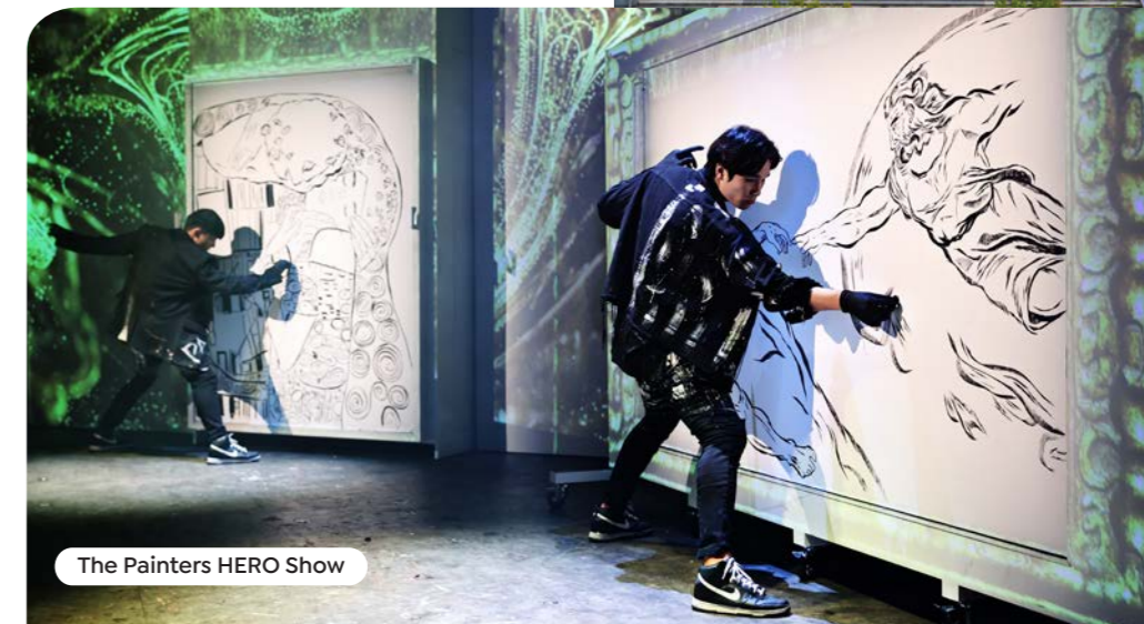
The Painters HERO Show