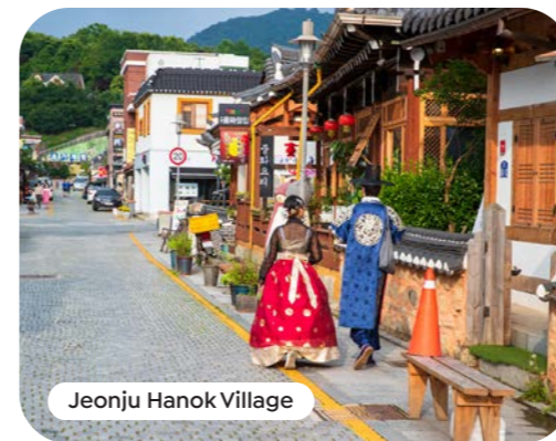
Jeonju Hanok Village