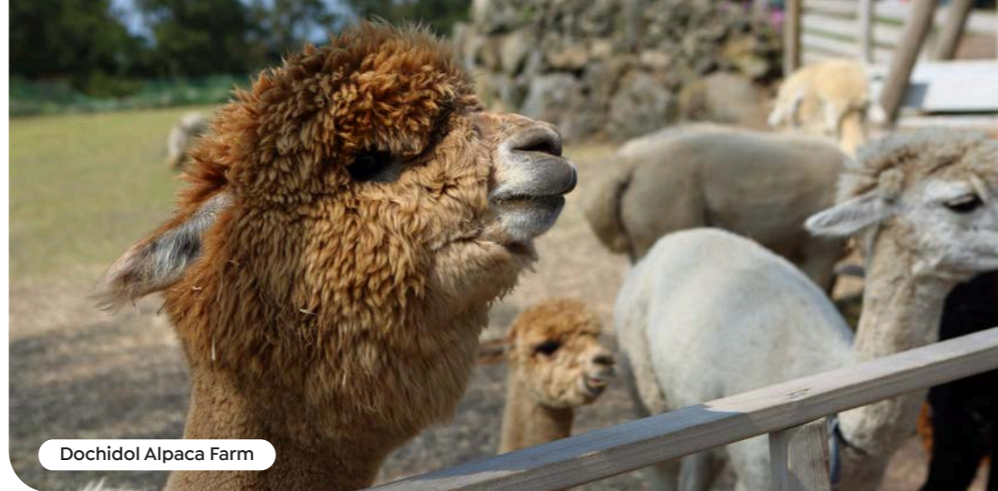
Dochidol Alpaca Farm