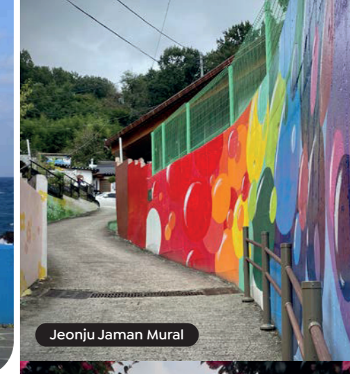
Jeonju Jaman Mural