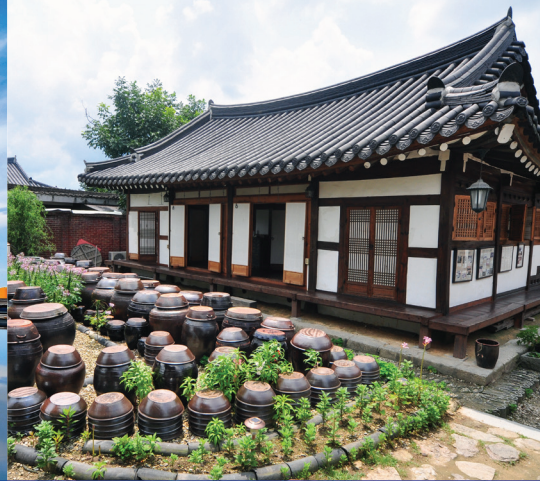
Jeonju Hanok Village | 全州韩屋村