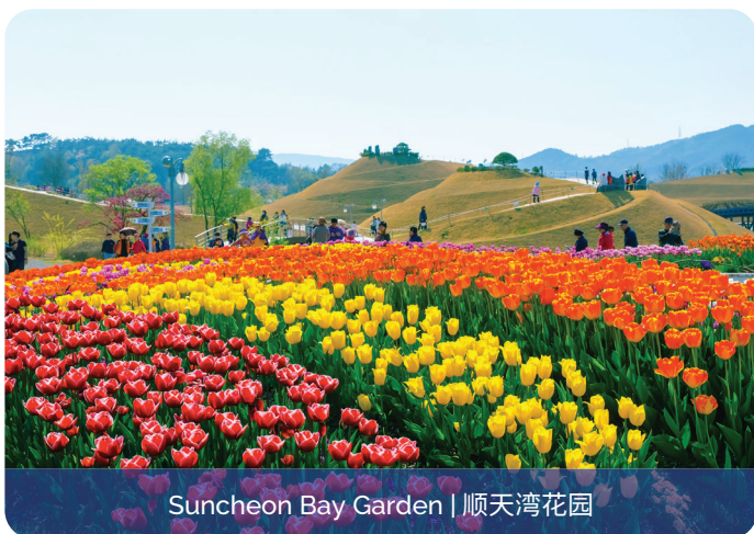
Suncheon Bay Garden | 顺天湾花园