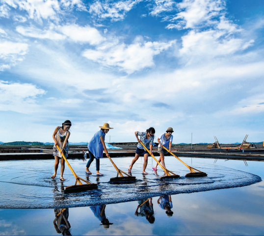
Taepyeong Salt Farm | 太平盐田