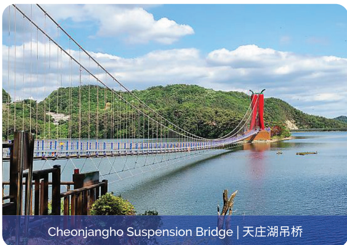
Cheonjangho Suspension Bridge | 天庄湖吊桥