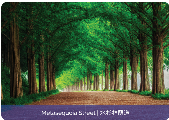
Metasequoia Street | 水杉林荫道