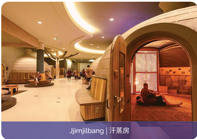
Jjimjilbang | 汗蒸房