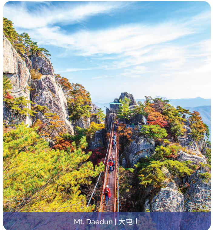
Mt. Daedun | 大屯山