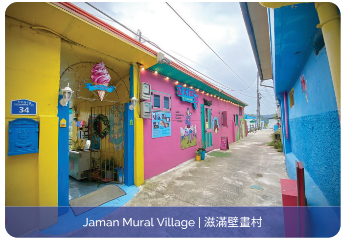
Jaman Mural Village | 滋滿壁畫村