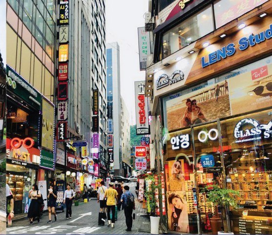
Myeongdong | 明洞