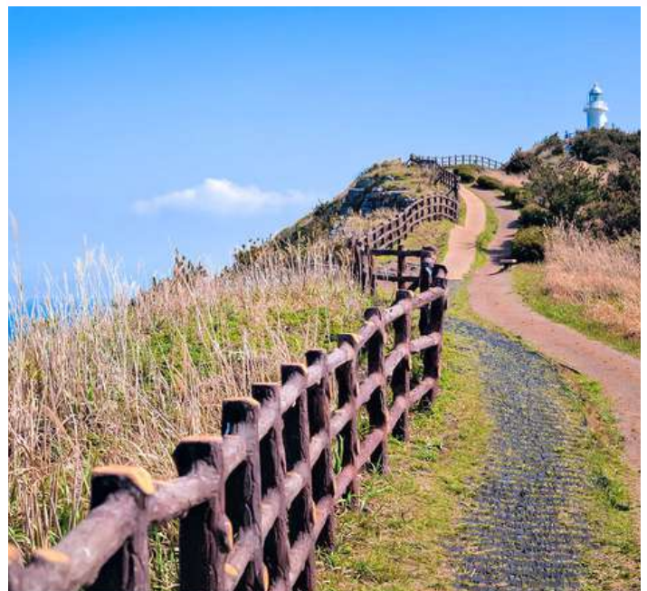
📍 Udo Island