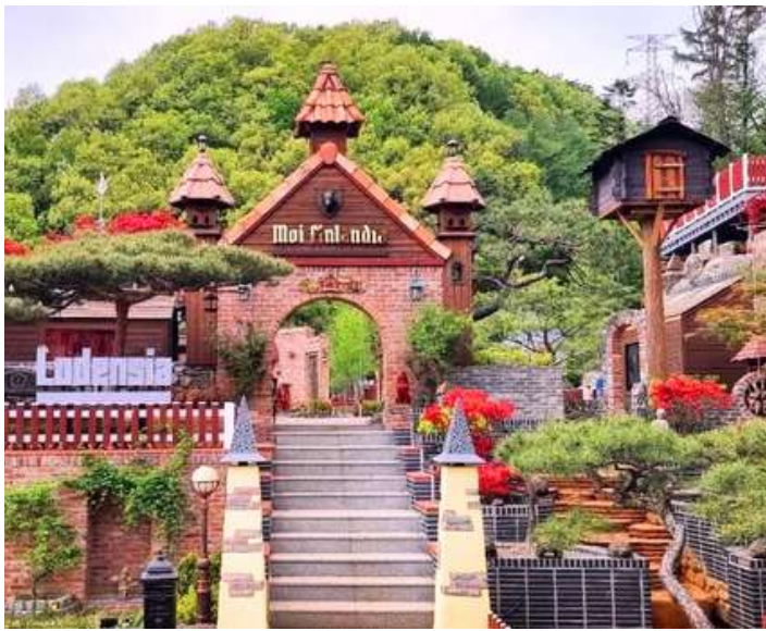
📍 Yeoju Ludensia Park