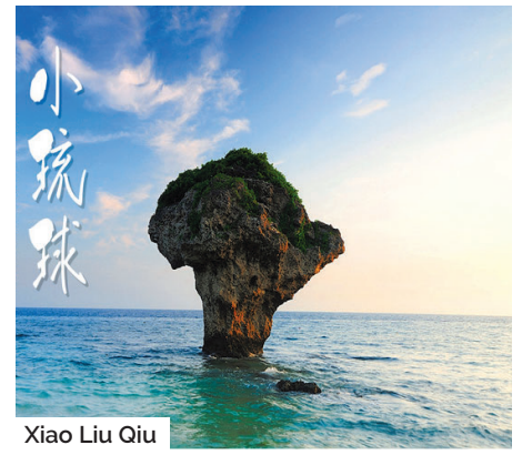
Xiao Liu Qiu

After breakfast, visit Hinoki Village . It consists of a number of Japanese influenced huts which were apparently dormitories for the forestry division