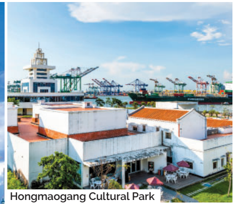
Hongmaogang Cultural Park