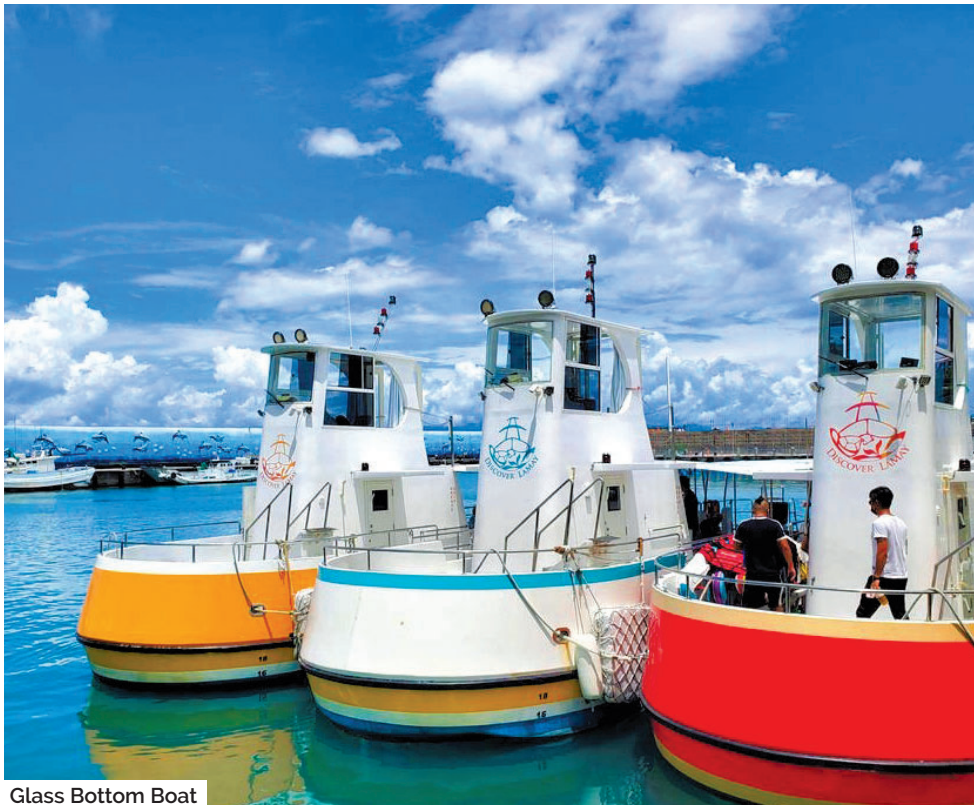
Glass Bottom Boat