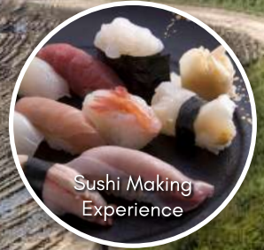
Sushi Making Experience