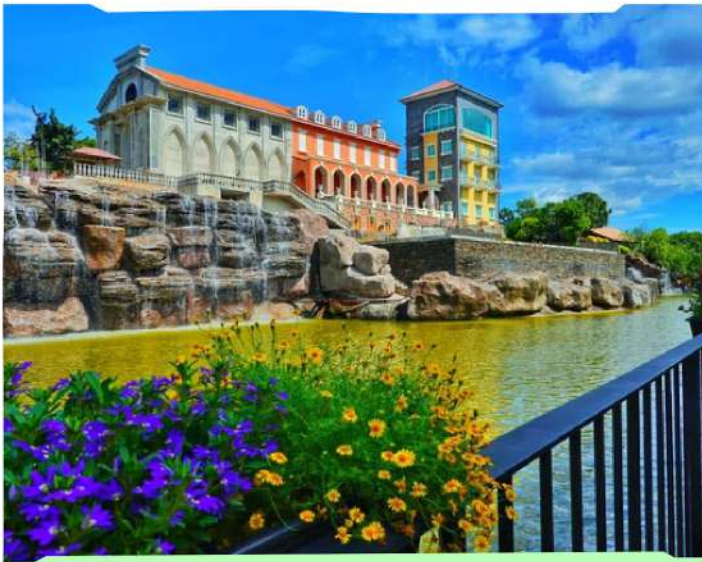
📍 Lago Di Khao Yai