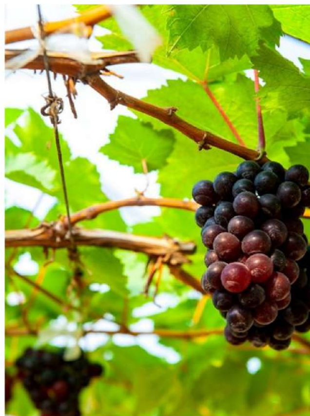
📍 PB Valley

Meal on board not included, for low cost carrier flight.