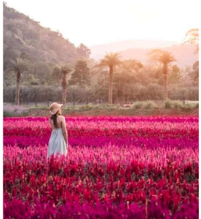
Hokkaido Flower Park