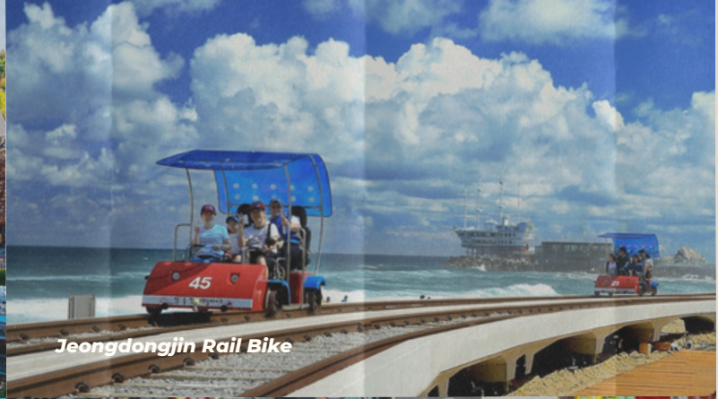
Jeongdongjin Rail Bike