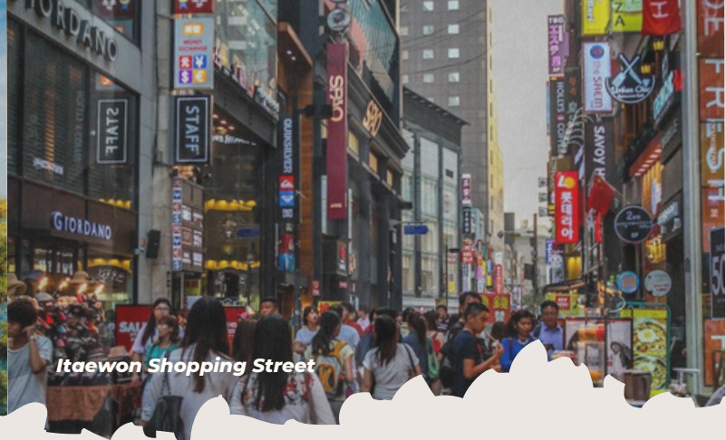
Itaewon Shopping Street