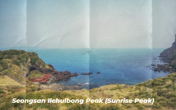
Seongsan Ilchulbong Peak (Sunrise Peak)