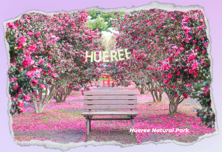
Hueree Natural Park