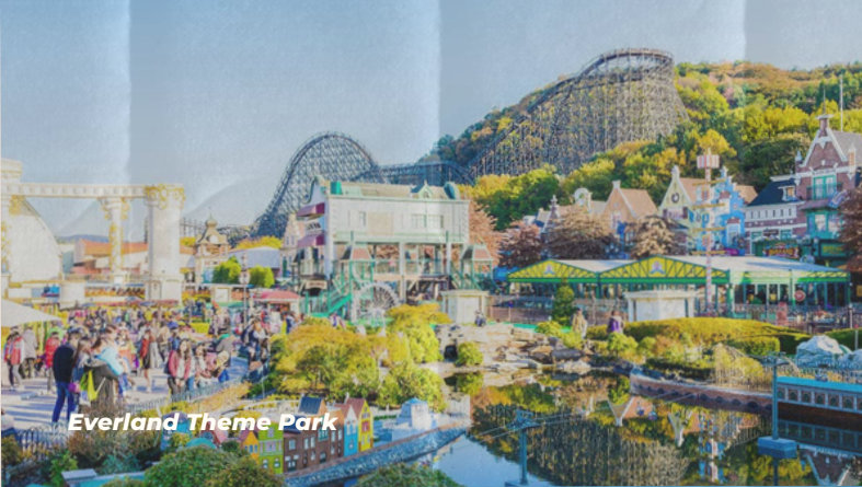
Everland Theme Park