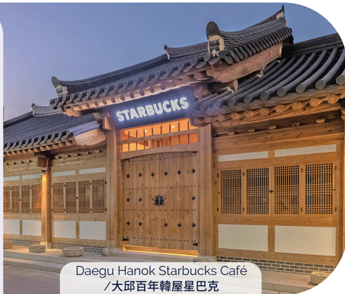
Daegu Hanok Starbucks Café / 大邱百年韓屋星巴克