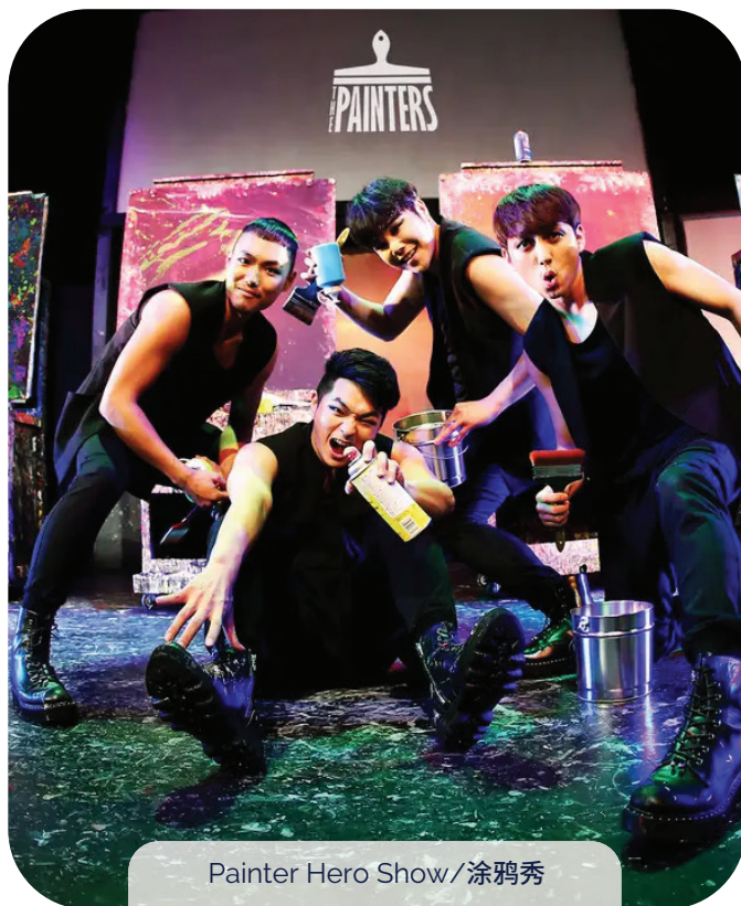
Painter Hero Show/涂鸦秀

*Note : A levy of USD150 will be collected from each passenger who leaves the Seoul City tour group.