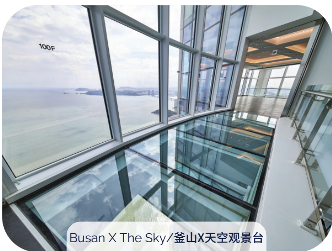
Busan X The Sky/釜山X天空观景台