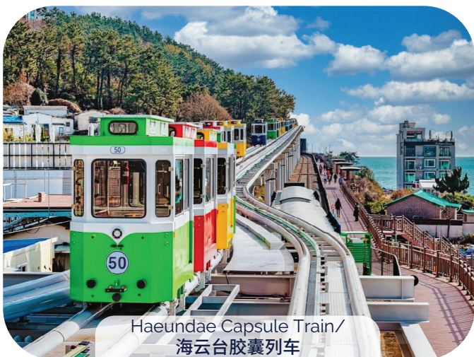
Haeundae Capsule Train/ 海云台胶囊列车