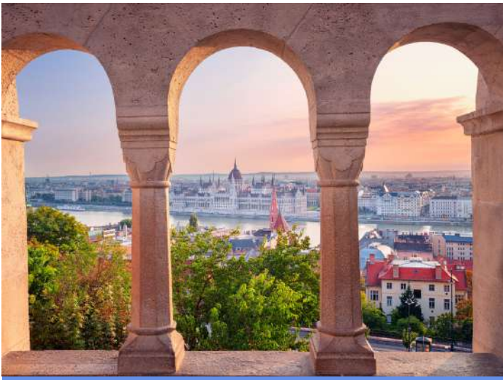
📍 View from Fisherman's Bastion, Budapest

Day 7 | KRAKOW - DONOVALY - BUDAPEST Breakfast, Dinner with Hungarian Folk Show