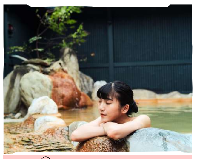
Chu Resort hot spring