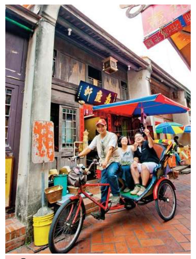
② Lukang Old Street (trishaw ride)

After breakfast, proceed to Taoyuan airport for our flight back to Singapore. We hope you enjoyed your trip to Taiwan with Nam Ho Travel!