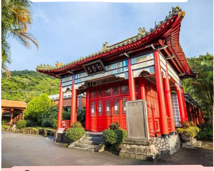
Shilin Official Residence Garden