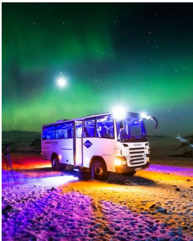
📍 Aurora Hunting by bus