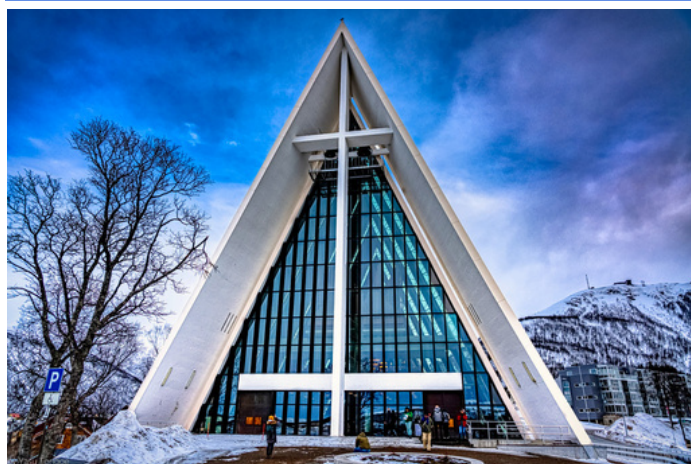
📍 Arctic Cathedral