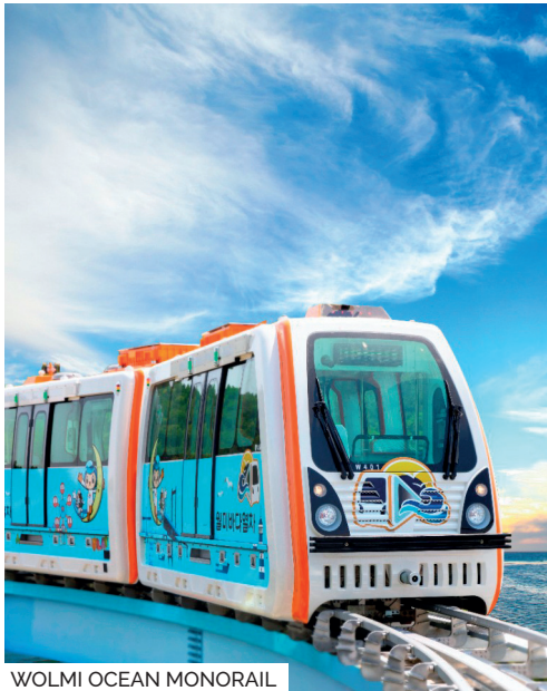
WOLMI OCEAN MONORAIL