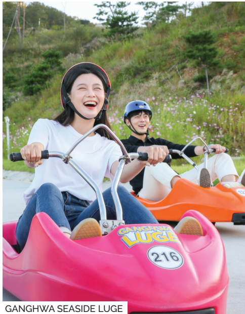
GANGHWA SEASIDE LUGE