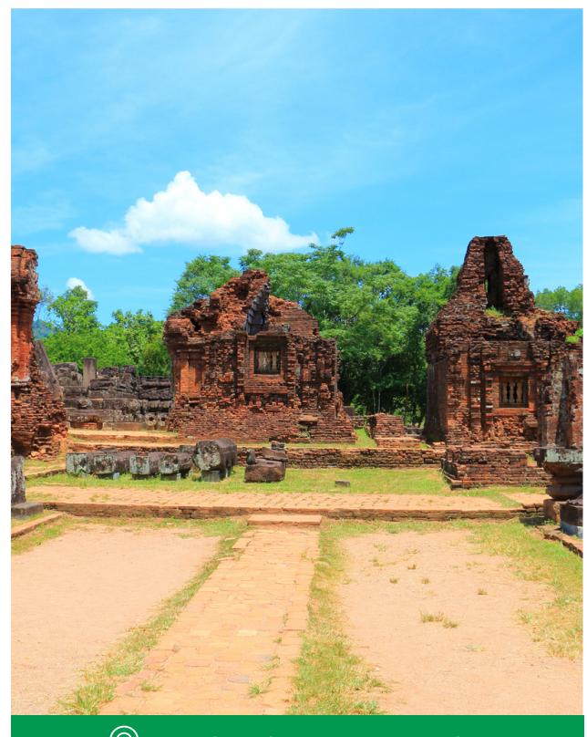
🔗 My Son Sanctuary, My Son