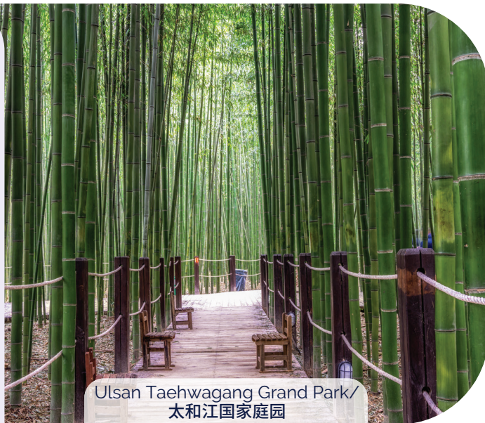
Ulsan Taehwagang Grand Park / 太和江国家庭园