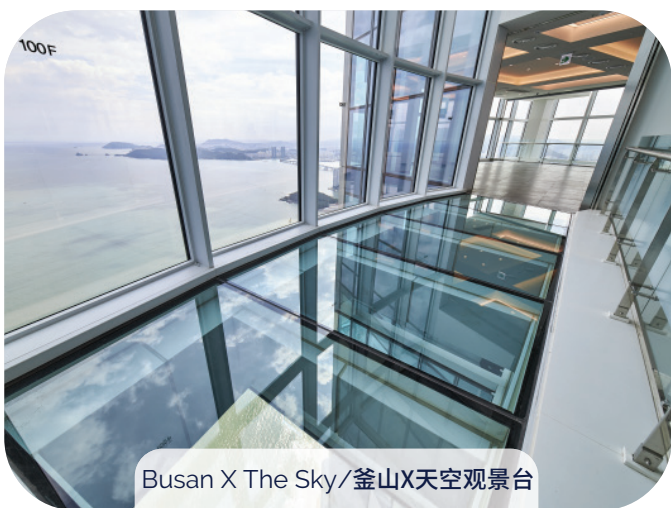
Busan X The Sky/釜山X天空观景台