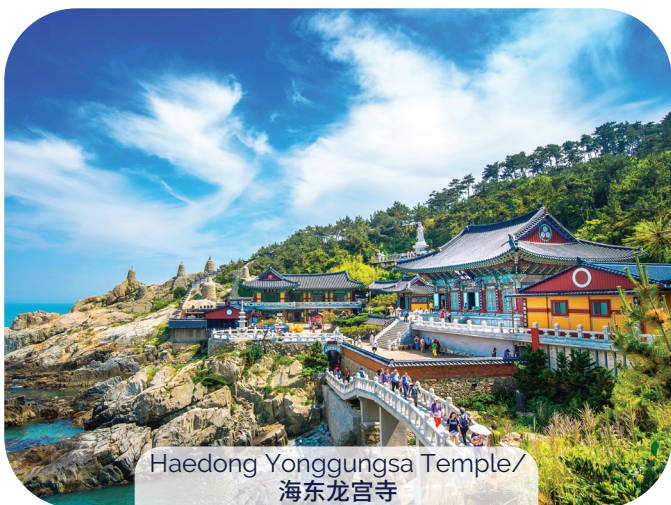
Haedong Yonggungsa Temple/ 海东龙宫寺