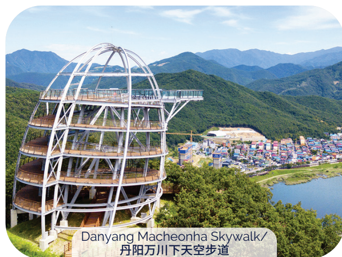
Danyang Macheonha Skywalk/ 丹阳万川下天空步道