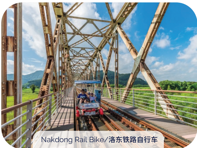
Nakdong Rail Bike/洛东铁路自行车