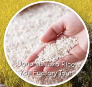
Uonuma Jozo Rice Koji Factory Tour